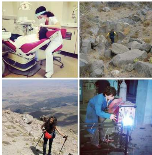
Figure 1: Feminists share photos that display the diverse acts of women

Criticizing Orkid for failing to adapt the original Always advertisement, feminists call women for action to share photos of themselves that would shatter the like a girl myth in Turkey. In the following days, total of 48 photos were published on the activism's Facebook account, each portraying women in various actions. 6 The photos included women wearing military uniform, fixing an automobile, boxing, doing home repair, climbing up the mountains, watching soccer, bodybuilding, playing the guitar with having a beer, drinking raki, carrying a washing machine to the third floor and riding a truck (Figure 1). They also prepared several other images, which include women in Turkey who managed to achieve success in their careers that are dominated by men; such as a soccer referee, a truck driver, a scientist, a mathematician and a politician (Figure 2). In this way, feminist attempt to fill in the gaps that exist in Orkid advertisement in terms of challenging "like a girl" myth by emphasizing best practices. Their attempt also show that they criticize Orkid advertisement for failing to address the crucial issues regarding gender inequality in Turkey, which is strongly felt in all areas of social life.