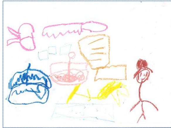
Figure 4. The picture drawn by C2 about Turkish delight after the trip