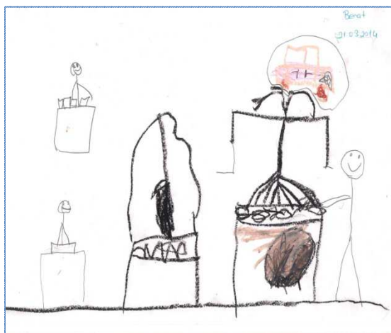
Figure 1. The picture drawn by C1 about Turkish delight before the trip

Examples of pictures drawn by children before and after the trip are given below: