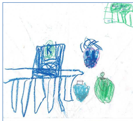
Figure 2. The picture drawn by C1 about Turkish delight after the trip