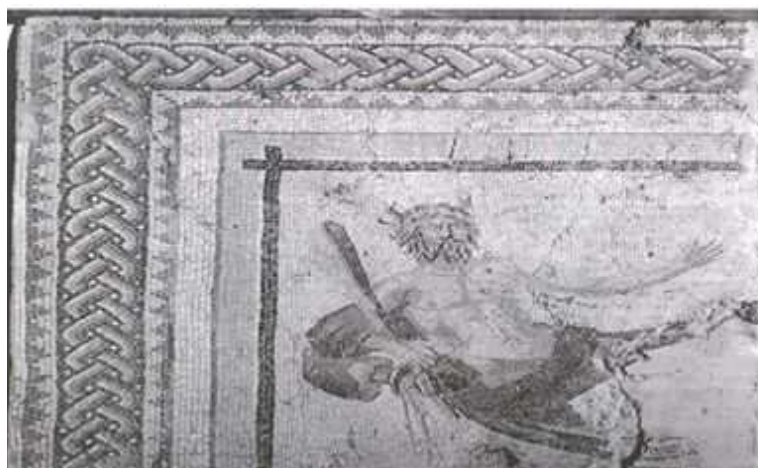
Figure 2: Antioch, Oceanus and Tethys

The earliest Depictions busts of Oceanus and Tethys have been found in Antioch. In such mosaics, the busts of Oceanus and Tethys are generally seen within a square or rectangular frame. The most prominent feature of these mosaics is that bodies of Oceanus and Tethys were pictured as coming out of the sea side by side at shoulder length. In all of such mosaics they are surrounded by marine animals. All Tethys figures in this type have a pair of wings on their forehead as seen in all depictions in whole-body form. The common characteristic of Oceanus figures of this type is that all of them have bushy hair and beard. Moreover, all of them were depicted with a pair of claws arising from the bushy hair.