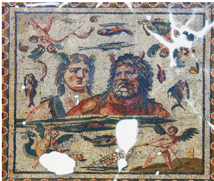
Figure 3: Antioch, Oceanus and Tethys

One of the earliest examples of such mosaics has been found in "House of Menander" dated 3rd century AD in Antioch (Levi,1947: 214; Cimok, 2000: 187) (Fig. 3). Designed on a central basis, a large part of the mosaic is covered by Gods and Goddesses. Eros figures were placed reciprocally and upside and down. The fish on left and right sides of Oceanus and Tethys swim symmetrically towards each other. In the mosaic, the artist created a three dimensional effect in colours. The mosaic has the characteristics of naturalistic Greco-Roman style in terms of technique and style. The importance attached to presentation of figures rather than geometrical ornamentations or ornamental plant in pictorial areas is observed in this mosaic too.