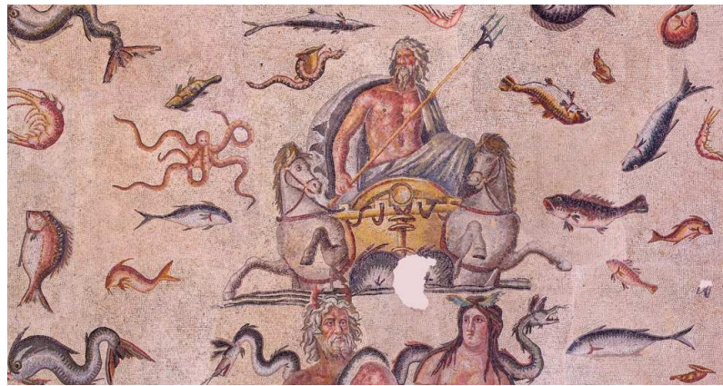
Figure 4: Zeugma, Oceanus and Tethys

too. In stylistic terms, it resembles the Tethys figure depicted in “Calendar House” mosaic. Both of these mosaics tend to display the characteristics of classical naturalism. The absent expression in the eyes of Tethys, the random placement of the fish, and showing the fish as if moving bear the characteristics of classical naturalist forms. The greatest similarity is seen in description of the fish, placed on all areas of the panels, swimming freely. Here, the artist aimed to imitate the marine life by including various fish in different colours such as octopuses, eels, shrimps and seashells.