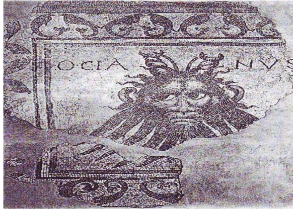
Figure 9: Montreal, Oceanus

One of such schematized examples has been found at hypocaust section of Glesia villa dated to 4th century AD in Montreal province of France (Balmelle, 1987: 194) (Fig. 9). The border of panel includes dolphin patterns and circled by two tiny stripes inside. The bust of Oceanus is in a central position on a white floor. Over his head is the inscription on which "OCIANVS" is written. In the model, displaying a stylistic approach towards abstraction which is completely different from the classical naturalist forms, the God was depicted as half human and half animal. The wild and angry expression observed in the eyes of Oceanus is different from the calm and attractive expression of Oceanus depicted in Asian Roman geography.