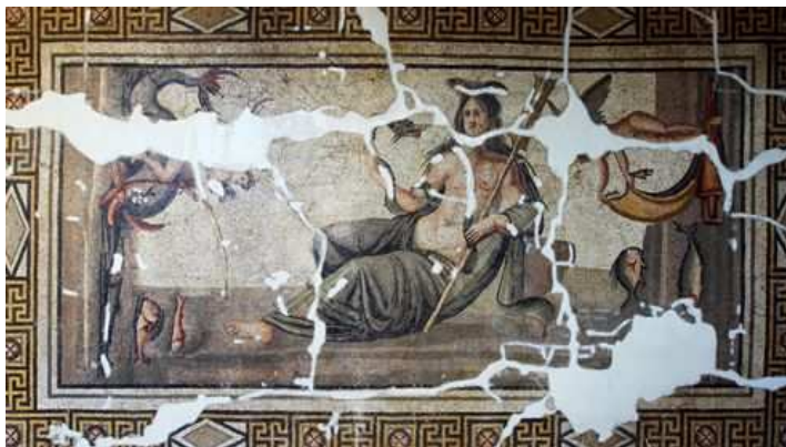
Figure 6: Seleucia Pierra, Tethys

One of the Tethys compositions has been found in Seleucia Pierra ( Samandağ), located in the environs of Antioch. Tethys pictured individually in whole-body form in the centre (Cimok, 2005: 62) (Fig. 6).