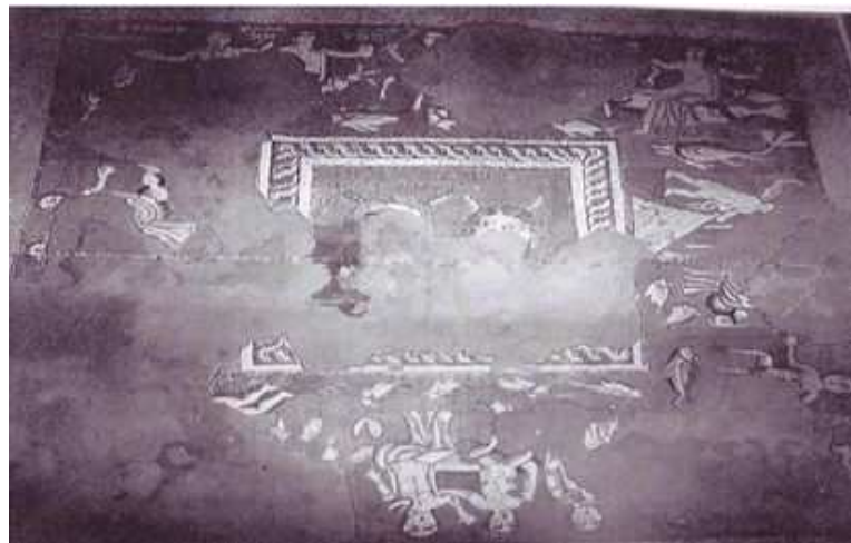
Figure 5: Garni, Oceanus and Tethys

One of the mosaics depicting Tethys and Oceanus together have been found pavement of Roman Bath in Garni. In the mosaic dated 3rd century AD, the outmost part of the panel was bordered by a pink stripe, and the figures of Nereid, Eros and fish ornament were used as border ornamentation (Wages, 1986: 120; Thierry- Donabedian, 1987:529) (Fig. 5).