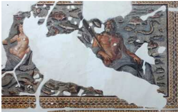
Figure 1: Antioch, Oceanus and Tethys

In the “Calendar House” mosaic, Tethys and Oceanus were depicted as surrounded by himation under their waists and together with various marine animals (Levi, 1947: 38–9; Lassus, 1983: 257; Campbell, 1988: 61) (Fig. 1). They both sit on the sea floor. Tethys leans left and raises her left hand up. She probably holds the body of Cetus with her left hand. The figures of Oceanus in such examples were described with a rudder resting on the shoulders and a pair of claws on hair. And Tethys was depicted with a pair of wings on her hair and a Cetus around. In the “House of Tethys and Oceanus” mosaic, they were depicted as half-lying reciprocally; their faces and bodies are parallel to each other (Levi, 1947: 222) (Fig. 2). It seems that whole-body representations of Oceanus and Tethys together are compositions of Antioch origin; and there is not an example, in which they were depicted in whole-body form together in Roman provinces other than Anatolia.