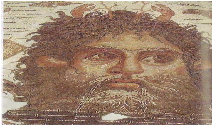
Figure 10: Themetra, Oceanus

One of these heads of Oceanus seen in frigidarium section of Roman bathhouse in Themetra city of Tunisia. In this mosaic, dated 3rd century AD, the big head of Oceanus was depicted with all its glory (Ben Abed-Ben Khader, 2006:115) (Fig. 10). Here, the fish, ships, fishermen and a few buildings complete the marine scene. The Oceanus head of Themetra is totally different from the ones created as a decorative theme with lineal shapes observed in late 2nd century AD. Such difference can be clearly observed in big and attractive eyes of Oceanus head, covering a large part of the panel, with dark green bulky hair and beard and sea water pouring down from the sides of his mouth.