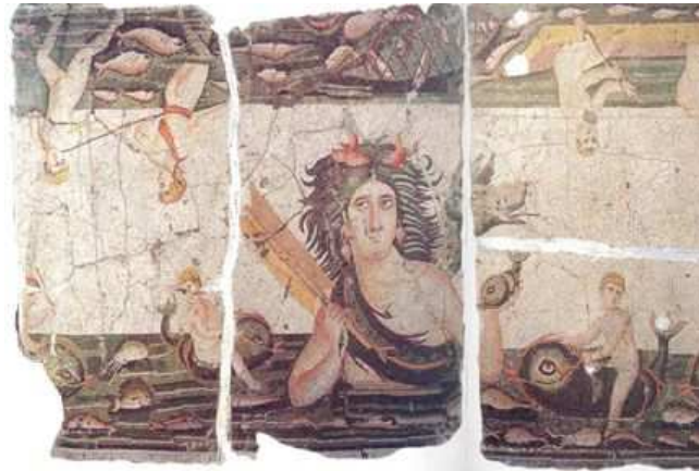
Figure 7: Antioch, Thalassa

were schematized differently from their real forms and they adopted a decorative form in the scene. The artist strengthened such decorative scene with Eros figures. The artists made the waves explicit with light and dark green tesserae. By using the tones of green, the artist succeeded in creating a marine atmosphere and used the sea as a border.