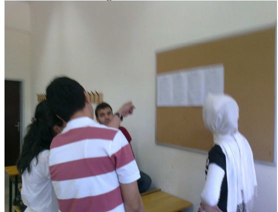
Figure 3. Students Discussing Their Mistakes Shown in the Corner

The above-listed errors can be frequently seen in the writings of students in Turkey. What is important here is the discovery of the ideal way to put an end to the repetition of them. Establishing a "pearls of wisdom corner" can be deemed as one of these effective ways. As its name implies, there is sheer irony behind its philosophy. Some may argue that it is not irony, it is sheer sarcasm; however, in practice, it proves to be an entertaining way of discovering one's own mistakes in writing papers. It is not applied to offend students, if so it would be totally discouraging. The title alongside the whole application is intended to let the students make fun of their mistakes and notice what they cannot while producing written texts. The most important aspect of the application, as students agree, is the anonymity principle. The teacher writes the sentences casually with no specific order and without any clue of identity. Thus nobody, except for the owner of the sentences and the teacher, has any information as to the identity. This secrecy actually adds more fun to the learning process. Figure 3 below illustrates how students discuss their mistakes during a break.