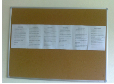
Figure 2. Pearls of Wisdom Corner

Establishing a "Pearls of Wisdom Corner" in a writing class can be regarded as an indirect and implicit way of giving feedback to the writings of the students by the instructor. This type of feedback covers the drafts in the "responding" stage of the writing process as illustrated in Figure 1 above or the students' final drafts they submit in writing quizzes and exams. A "Pearls of Wisdom Corner" established under the framework of this study is illustrated in the following figure: