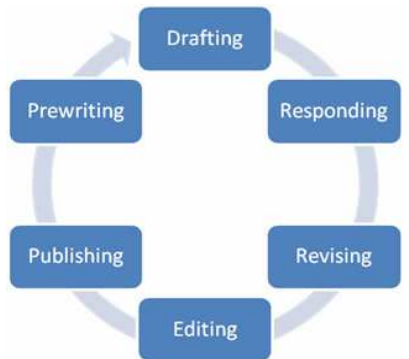
Figure 1. Process Approach to Writing

Rivers (1981) compares the two productive skills, writing and speaking, and puts forward that writing comprehensibly is much more difficult than speaking comprehensibly as writing does not bring instant feedback unlike speaking. In order to eliminate this comprehensibility problem, a new perspective to writing called "process approach" has begun to be adopted in recent years. Process approach can be defined as "an approach that emphasizes teaching writing not as product but as process; helping students discover their own voice; allowing students to choose their own topic; providing teacher and peer feedback; encouraging revision and using student writing as the primary text of the course" (Matsuda, 2003: 67). As the definition makes it clear, process approach takes writing as a skill to be developed on a student-centered and process-oriented basis. The following figure describes the major steps included in the writing process.