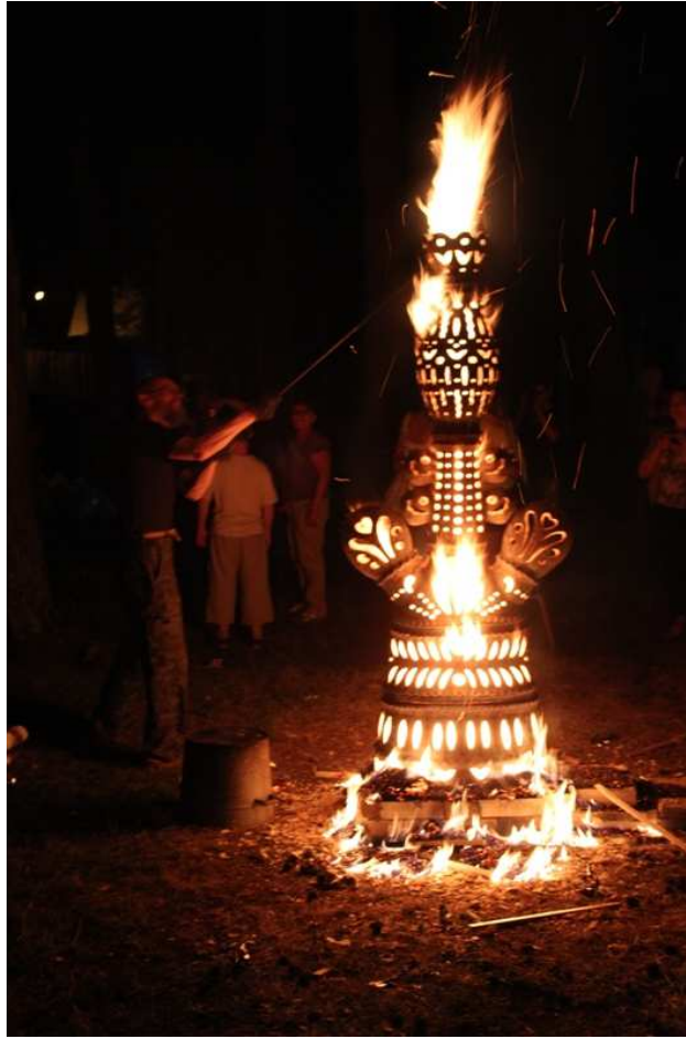
Figure 8: The Ceremony for the ZHYZHAL.