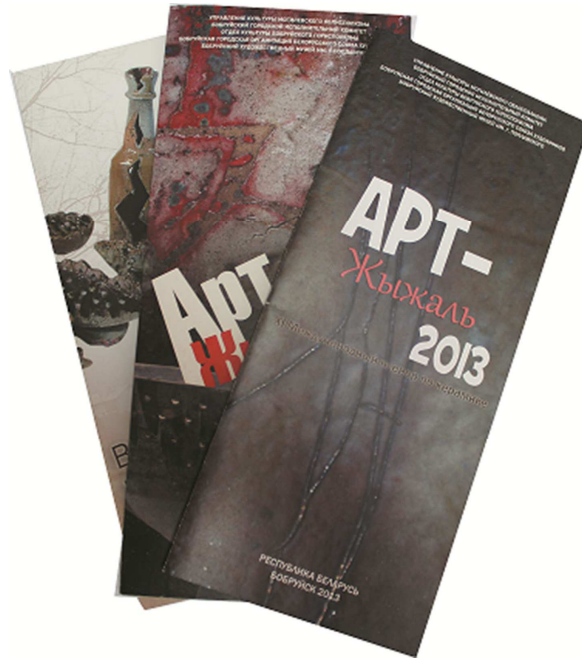
Figure 4: The Leaflets of the Plein Air.

The Plein Air “Art ZHYZHAL” is a respite from the usual daily routine of ceramists, allowing them to enter a different world of art as part of an ongoing creative process. It is an excellent opportunity to test oneself within the quivering flaming environment of ceramists. Ceramic work is poetically challenging – and includes the bitterness of abject failure and the joy of extreme success.