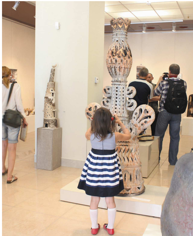
Figure 9: The Exhibition at the Bobruisk Art Museum.