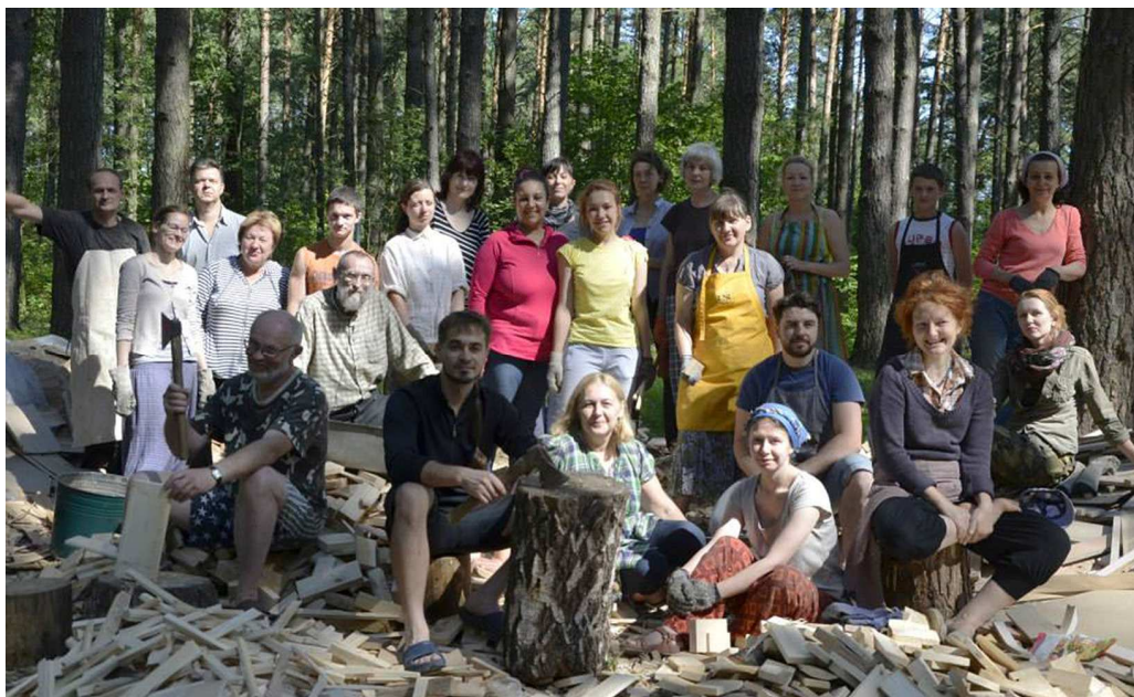
Figure 5: Preparing the Woods for the Firing by the International Participants, 2014.

The participants are provided with full board as well as materials and equipment for work. They organize their working places, build ceramic furnaces; pile up their stock of firewood and make kilns all by themselves. All shaping is only done from clay and chamotte by hand and potter’s wheel.