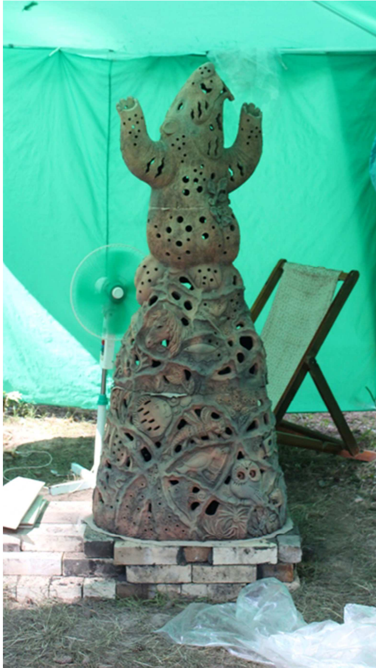
Figure 7: The Sculpture that Built by Valery Koltygin of which Some Parts were Added by the Participants.