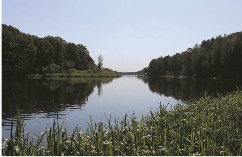
Figure 1: The view of the Berezina River.

This study was carried out using participant observation method. The observation was made in 2014 by participating in the event as an invited artist. The mentioned event was the 12th activity of Plein air and the observation took place in with the 22 international ceramic artists. The observation was lasted 23 days at the pottery Plein air workshop place. Do you know there is an International Plein Air Ceramic "Art Zhyzhal" (Zhyzhal is the God of the underground fire in the Belarusian traditional folk mythology), (Anonymous, The Leaflets of the past Plein Air events 2011-2013.) Master Class, which takes place at the recreation center of the Verbka hotel complex (JSC "FanDOK"), on the Berezina River in Bobruisk, which is in the Mogilev region of The Republic of Belarus? The class is a form of international studio where genuine masterpieces are created from clay.