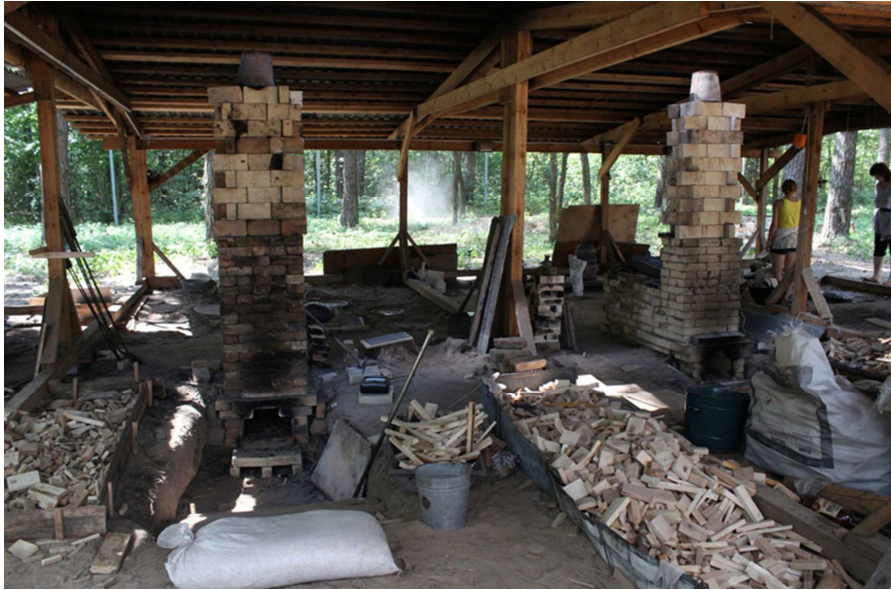
Figure 6: The Firing Places of the Plein Air.

execution, re created with the oldest, Belarusian technologies, such as manual and pottery forming, fuming and scalding in various composite combination. It can therefore be seen that The International Plein Air in ceramics "ART-ZHYZHAL" is a joint creative work completely different in age, experience, professional levels, nationality, temperament, and character personalities. It can be seen as a key to success.