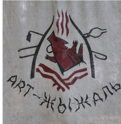
Figure 2. The Flag of the Organization.