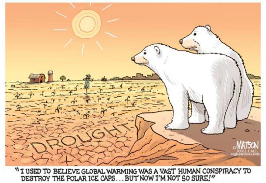
Figure 1. R. J. Matson's caricature (USA) which illustrates global warming

R. J. Matson is an American caricaturist whose more than 800 works have been published on newspapers and various publications. He is both an editor caricaturist of Roll Call and has been working as an editor caricaturist in such publications as St. Louis Post-Dispatch, The New York Observer etc. since 1986. His caricatures and illustrations have been published on such world-wide famous publications as The New Yorker, The Nation, MAD Magazine, City Limits, The Daily News, The Washington Post, Washington City Paper, Capital Style and Rolling Stone (http://www.rjmatson.com/personal.htm, 10.08.2016).